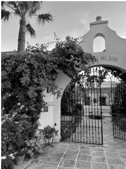
La Finca del Nino.

Costa Del Sol is a wonderful and exciting place to visit. La Finca has a pool and it’s within 1/2 mile of Benajafe Beach. This 10 night stay includes many day trips in the costa del sol area such at Nerja, Benagalbon, etc.